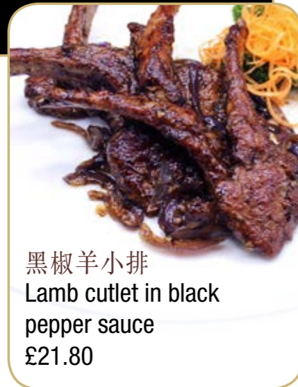
黑椒羊小排 Lamb cutlet in black pepper sauce £21.80