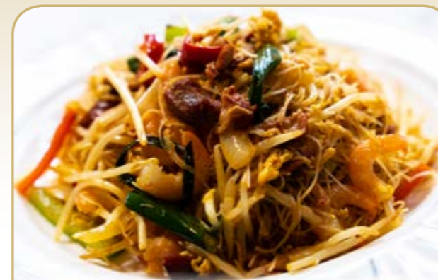
星洲炒米粉 Singapore vermicelli 🌶️ 🌶️ £12.80 (thin rice noodles with roast pork, chicken, prawn, egg and curry powder)