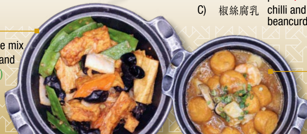
海鮮玉子豆腐煲 Braised mix seafood and silken egg tofu in hot pot £15.80

羅漢齋煲 "Monk" Chinese mix vegetable, tofu and glass noodle (V) £12.50