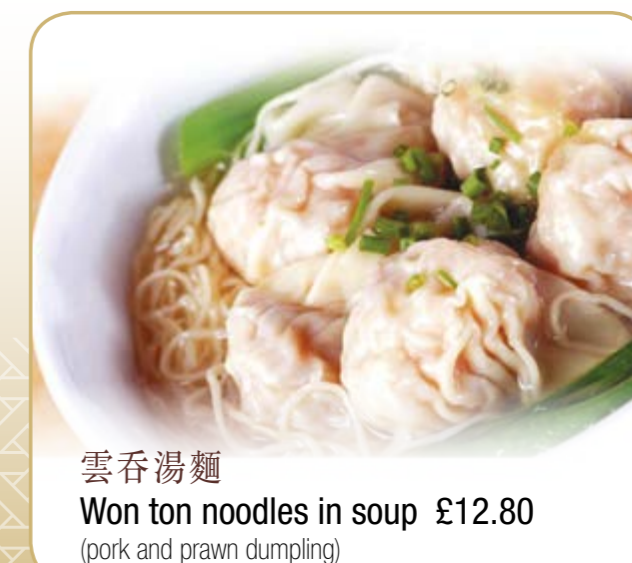
雲吞湯麵 Won ton noodles in soup £12.80 (pork and prawn dumpling)

叉燒湯麵 Roasted honey pork noodles in soup £12.80