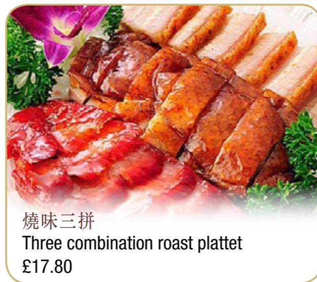
燒味三拼 Three combination roast platter £17.80

明爐燒鴨 Roast duck cantonese style A) 1/4 Quarter £15.50 B) 半隻 Half £22.00 C) 一隻 whole £38.00