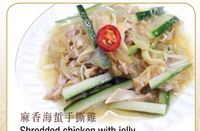
麻香海蜇手撕雞 Shredded chicken with jelly fish & sesame oil dressing £13.80