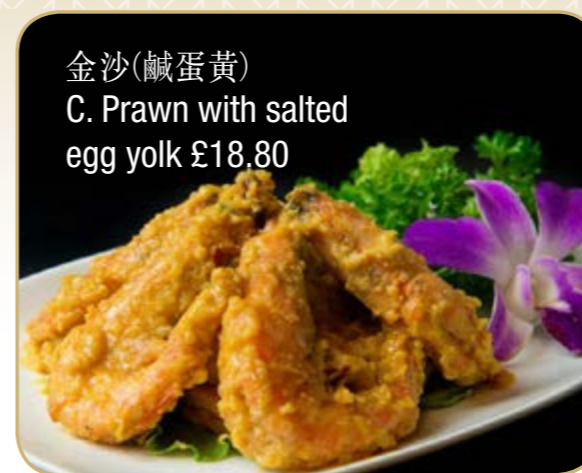
金沙(鹹蛋黃) C. Prawn with salted egg yolk £18.80