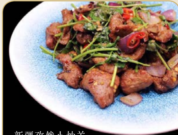
新疆孜然小炒羊 Lamb with cumin, chilli & coriander Xinjiang style 🌶️🌶️ £16.80