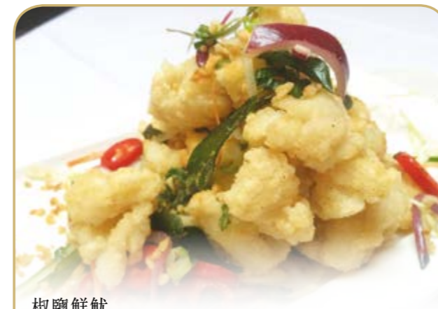
椒鹽鮮魷 Deep fried squid with salt & pepper

清炒四蔬 Stir fried mix vegetable 黃金蛋炒飯 Egg fried rice