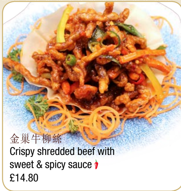
金巢牛柳絲 Crispy shredded beef with sweet & spicy sauce 🌶️ £14.80