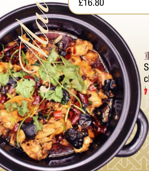
重慶麻辣雞煲 Sichuan spicy chicken hot pot £32.80