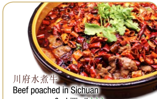
川府水煮牛 Beef poached in Sichuan peppercorn & chilli oil £18.80