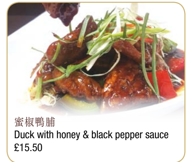
蜜椒鴨脯 Duck with honey & black pepper sauce £15.50