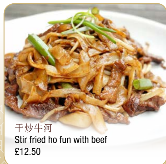
干炒牛河 Stir fried ho fun with beef £12.50