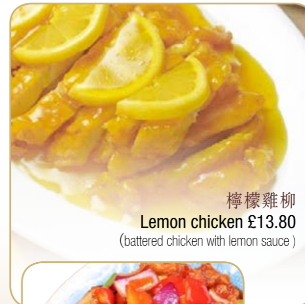
檸檬雞柳 Lemon chicken £13.80 (battered chicken with lemon sauce )