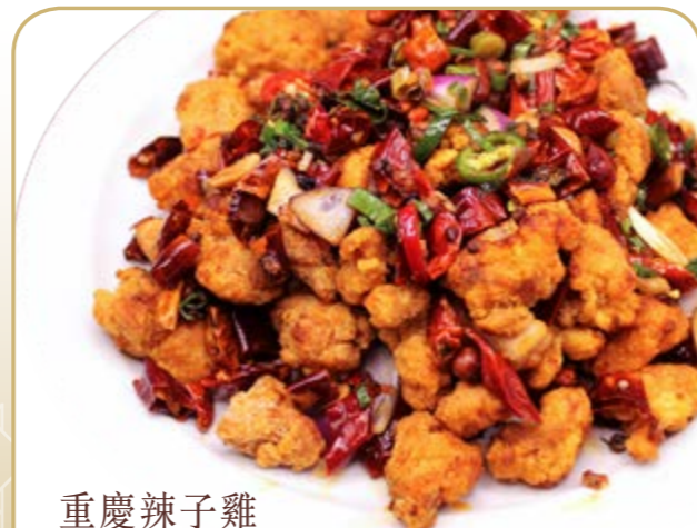
重慶辣子雞 Sautéed chicken with Sichuan peppercorn & dry chilli £14.80