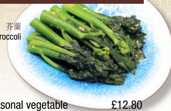
時蔬 Chinese seasonal vegetable £12.80