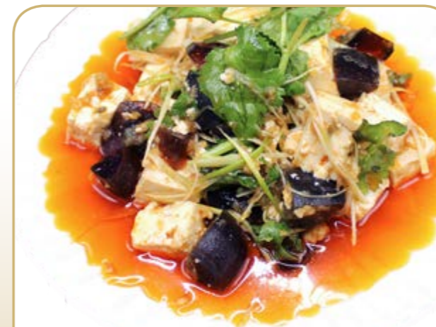
皮蛋嫩豆腐 Tofu with preserved egg and spring onion 🌶️ £8.80