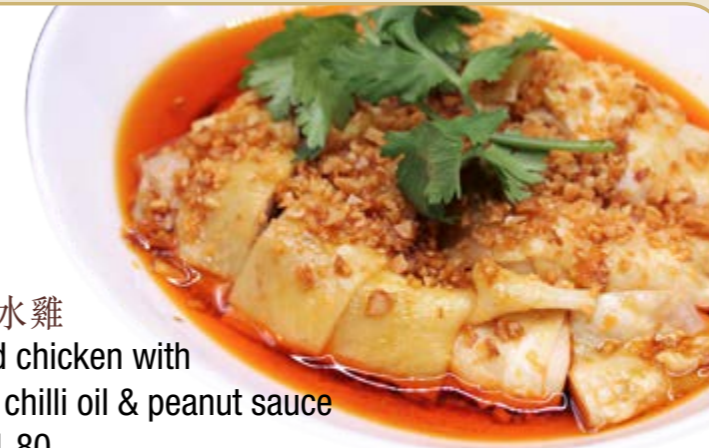
四川口水雞 Steamed chicken with Sichuan chilli oil & peanut sauce 🌶️🌶️ £11.80

Please let us know of any allergies before ordering.