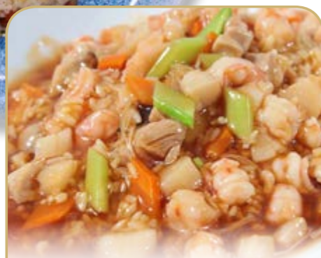
福建炒飯 Fujian fried rice (seafood, duck, asparagus and mushroom in oyster sauce) £13.80