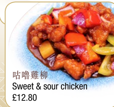
咕嚕雞柳 Sweet & sour chicken £12.80