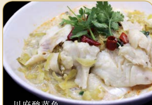
川府酸菜魚 Seabass fillet with Sichuan peppercorn & chilli in pickled sour vegetable soup £35.00