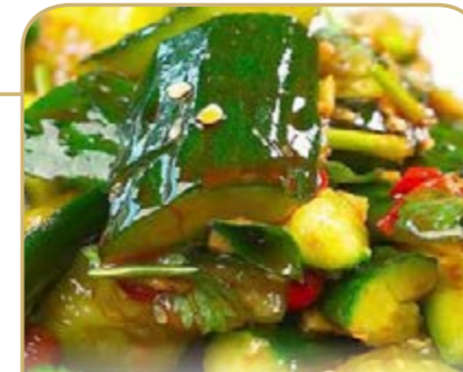
鮮蒜泥拍黃瓜 Smacked cucumber salad with garlic (V) 🌶️ £7.50