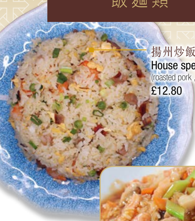
揚州炒飯 House special fried rice (roasted pork, shrimp and egg) £12.80