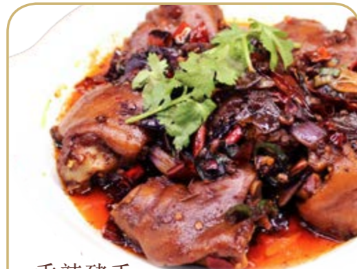
香辣豬手 Hot & spicy pork trotters (on bones) £16.80