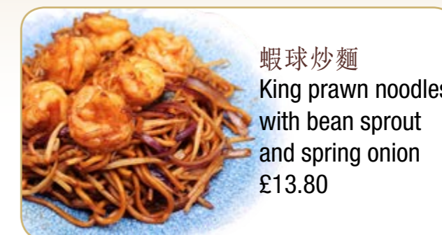
蝦球炒麵 King prawn noodles with bean sprout and spring onion £13.80

豉油皇炒麵 Fried noodles with bean sprout and spring onion (V) £7.50