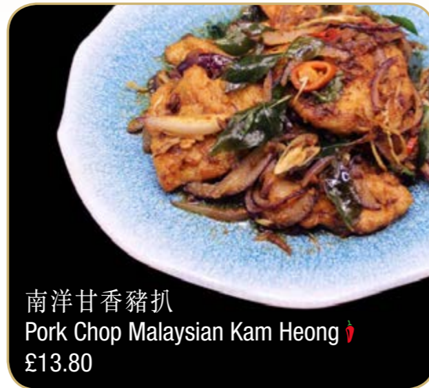
南洋甘香豬扒 Pork Chop Malaysian Kam Heong 🌶️ £13.80