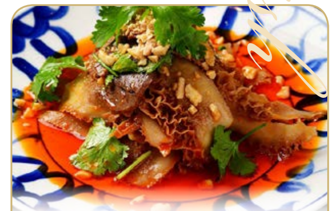
夫妻肺片 Mixed beef offal in spicy sauce 🌶️🌶️ £9.80